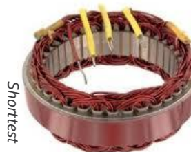
Electric motor under test